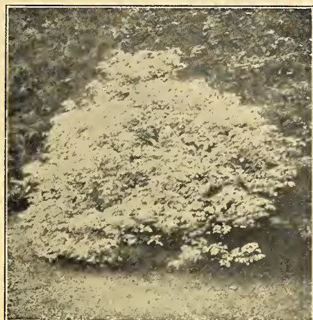
Cornus or Dogwood

MIXED COLORS, 3 FOR $1.00; PER DOZ. $2.85 Peonies, in separate colors. Red, White, Pink, Yellow, 2 for $1.00